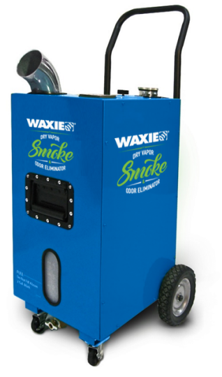
For maximum coverage, use with the Waxie Dry Vapor Smoke & Odor Eliminator.