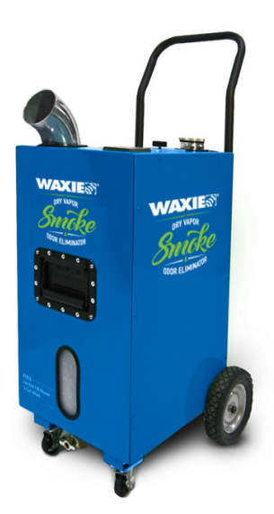
For maximum coverage, use with the Waxie Dry Vapor Smoke & Odor Eliminator.