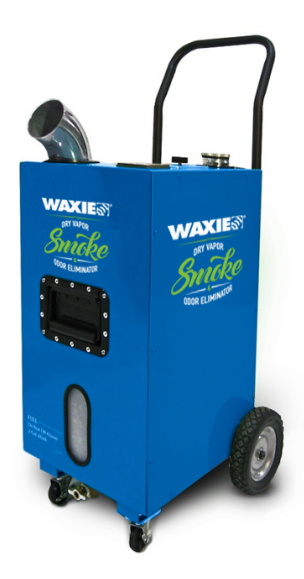
For maximum coverage, use with the Waxie Dry Vapor Smoke & Odor Eliminator.