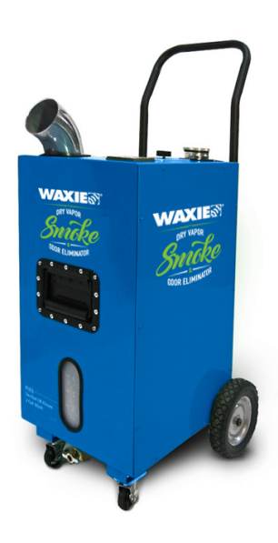
For maximum coverage, use with the Waxie Dry Vapor Smoke & Odor Eliminator.